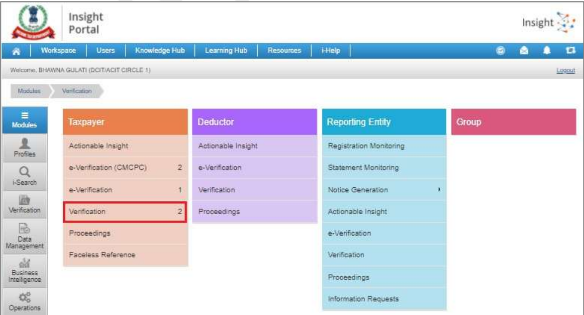
Figure 2 Verification Stage